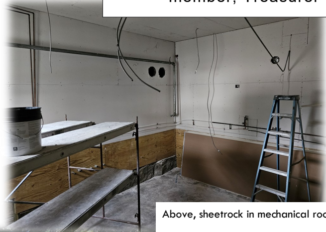
Above, sheetrock in mechanical room completed! Old subfloors getting hauled away (below).