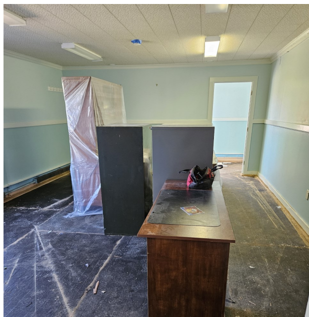
Damaged subfloors removed from downstairs offices & conference room.